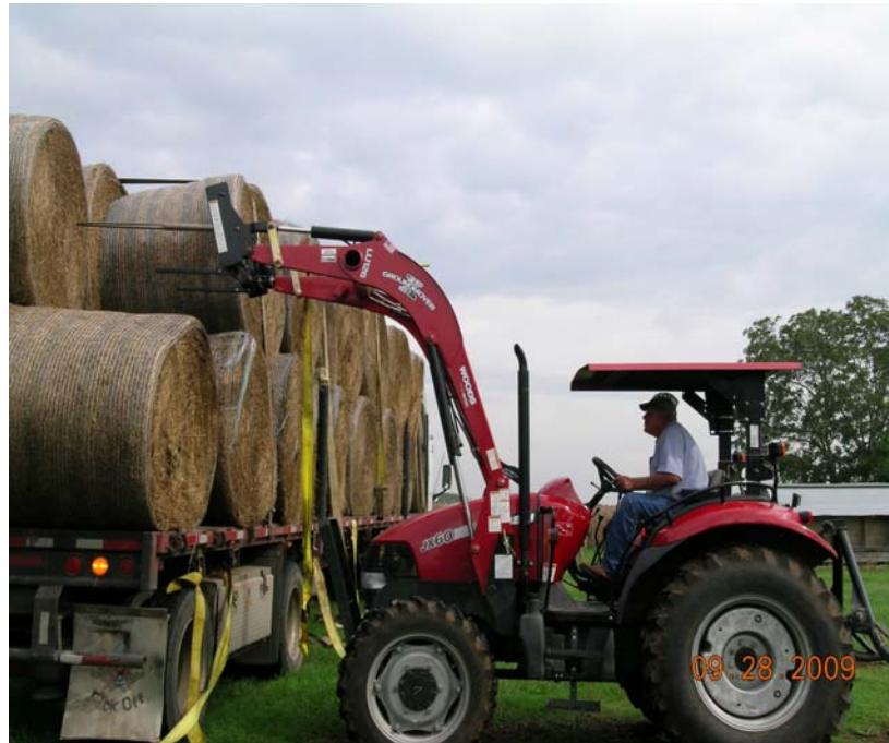
Hay brought in by De-Go-La delivered to Jackson County.