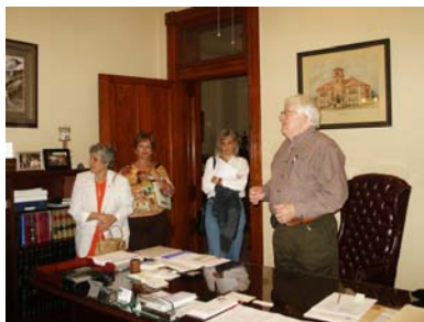
Inside view of a restored office in the Courthouse.