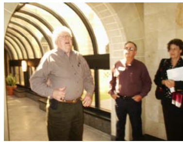
This covered hallway connects the restored courthouse to the newer buildings.