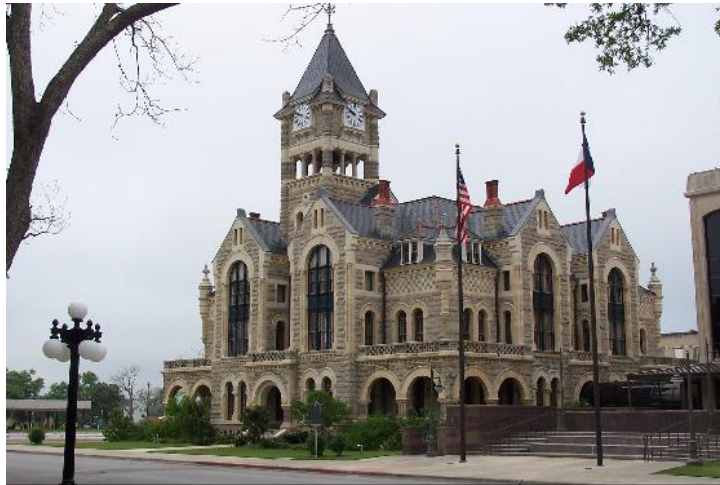
1892 Victoria County Courthouse Restored